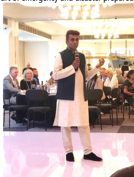
Let the Bollywood gala festivities begin!