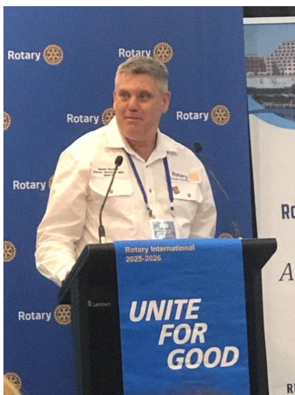
DGE Shane announces details of next year's conference to be held in Ulladulla on 5 - 7 March 2027