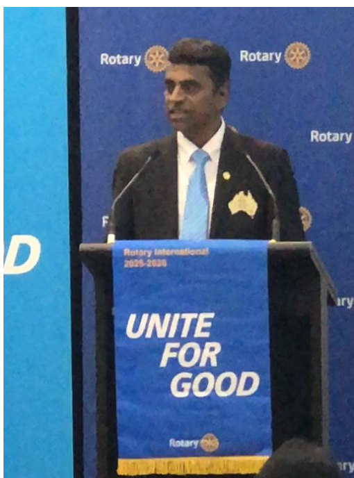
DG Renga opening conference proceedings