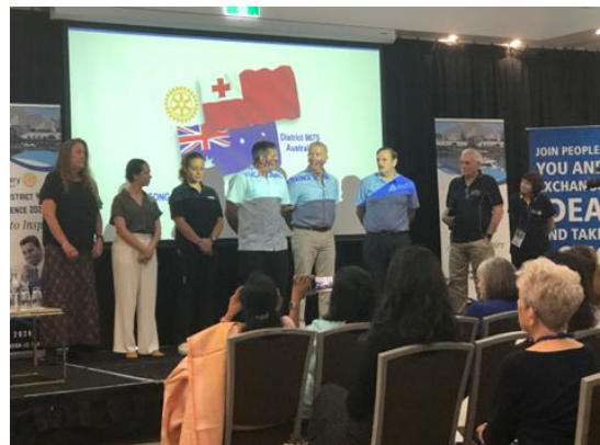
The next outbound Vocational Training Team who will be training locals in Tonga during August and September in the art of emergency and disaster preparedness.