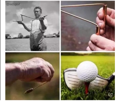
The trouble with quotes on the internet is that it's difficult to determine whether or not they are genuine.