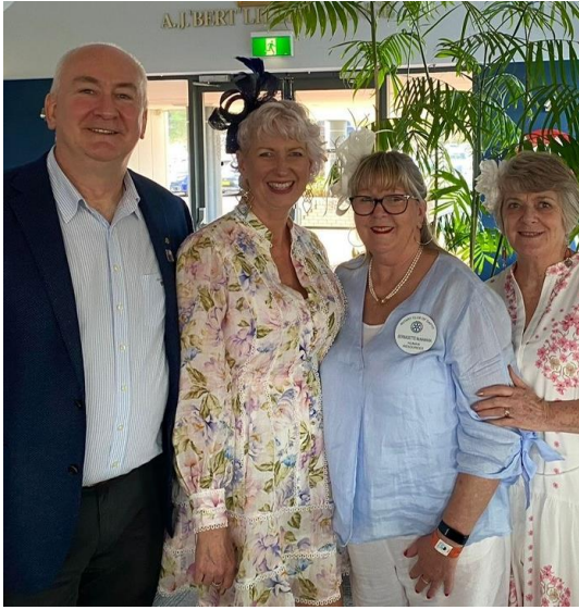
Our Race Day Organisers