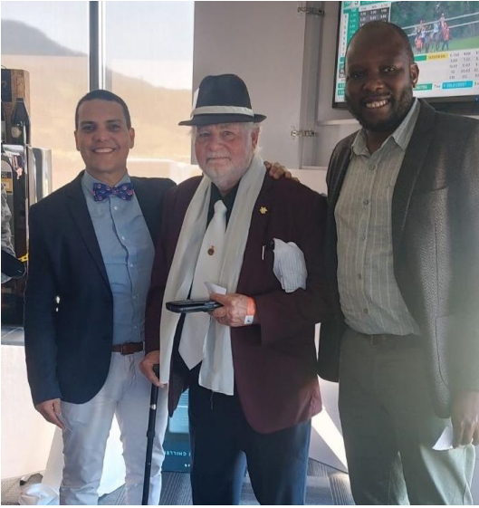
Our Handsome Gents

Tonight's Meeting is our Club Assembly. Please bring your ideas and suggestions with you!