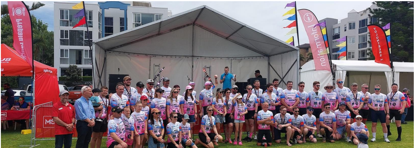
Above: Team MICH raised over $110,000 for MS this year (& over $270K during the previous five years)