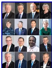
← Trustees to left, and President & Board of Directors to the right →

The Office of Investment is responsible for managing Rotary's investments according to policies set by The Rotary Foundation's Trustees and Rotary International's Board of Directors. Through a commitment to stewardship and excellence, they seek to establish a legacy that distinguishes Rotary as a prudent investor, supports Rotary's objectives, and promotes sustainability.