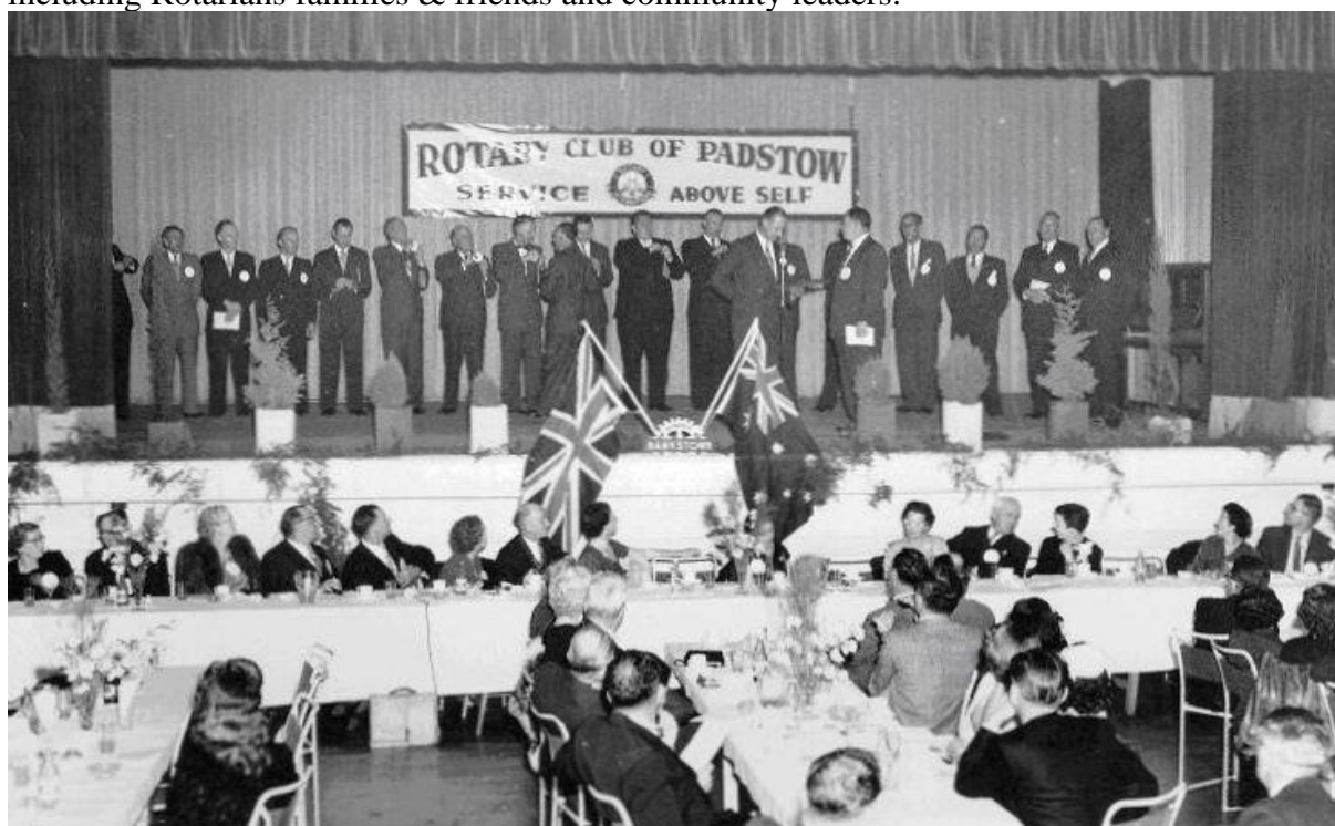
Charter Night of the Rotary Club of Padstow, June 20 th 1957.

The club was formally presented to the community on 20 th June 1957 with a gala event held at the Capital Ballroom Bankstown with great social success, attended by 320 guests including Rotarians families & friends and community leaders.