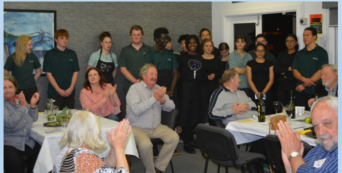
Students and Rotarians enjoyed themselves

Blackwood High School year 10 and 11 students became restaurateurs for a night when they entertained the Blackwood Rotary Club for dinner. With main course of salmon or chicken and dessert of panna cotta or moulded chocolate it was a high quality dinner with excellent service also by the students. This is an excellent example of the cooperation between Rotary and the School that allows great interaction between the students and Rotarians.. Many thanks to the staff of Blackwood High for organising the event.