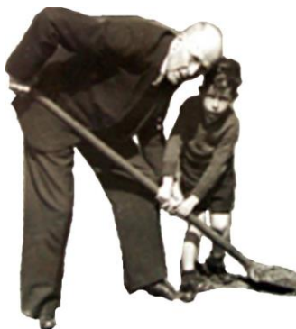
Paul Harris planting a Friendship Tree in Orlando, FL, USA March 1937

A 2004-10 pilot, e-clubs conducted 355 community service projects, over 105 international service projects, 55 vocational service projects, and 70 youth service projects. E-clubs gave more than $150,000 US to The Rotary Foundation, including more than $21,500 US to Rotary's $200 Million Challenge. As of June 2015, in less than five years, e-clubs have risen in number from 14 to 253.