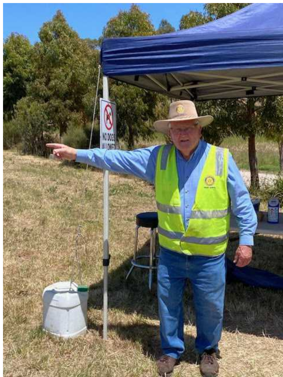
DIRECTING PARKING AT SOPHIE'S PATCH