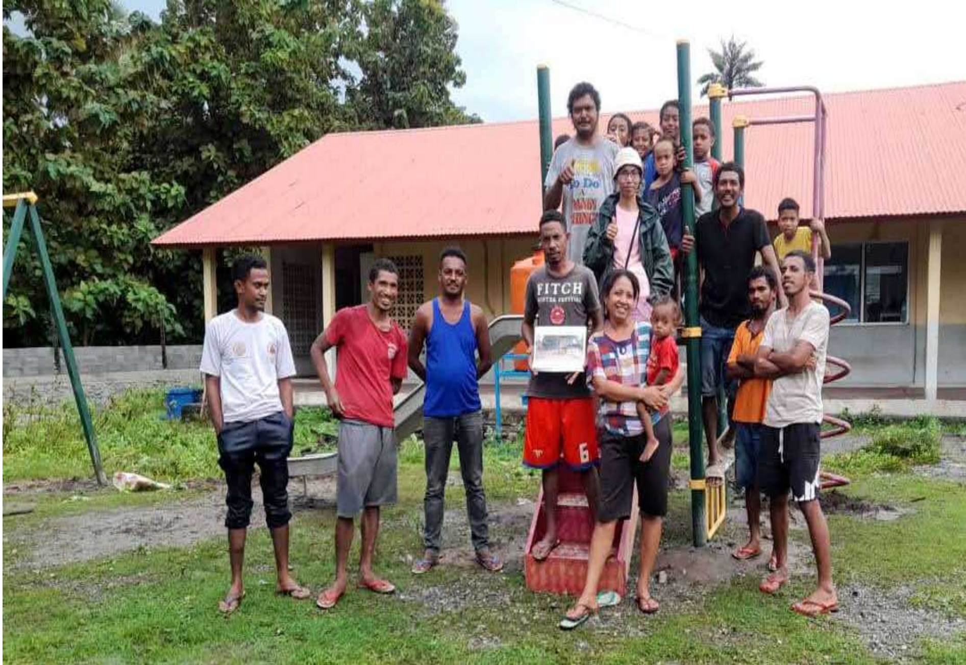
PLAYGROUND RECONSTRUCTION IN TIMOR LESTE