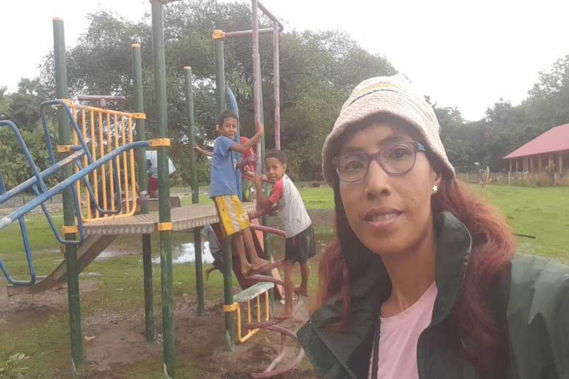
RELOCATED PLAYGROUND IN TIMOR LESTE