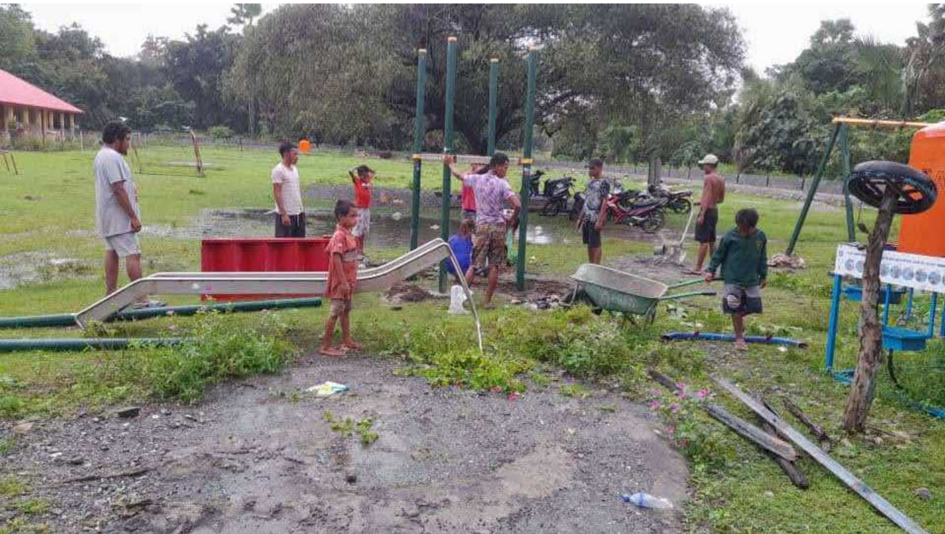
PLAYGROUND RECONSTRUCTION IN TIMOR LESTE