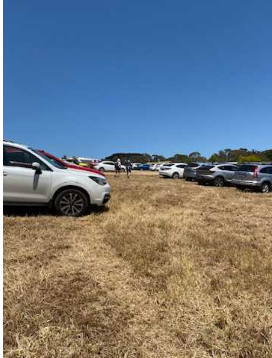
DIRECTING PARKING AT SOPHIE'S PATCH