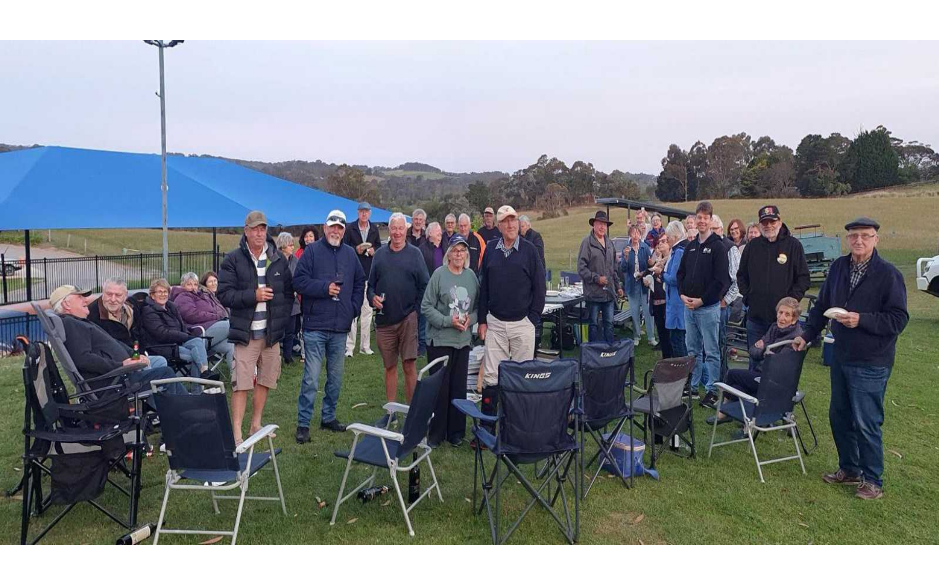
Social event at Hahndorf with Rotary Club of Waikerie