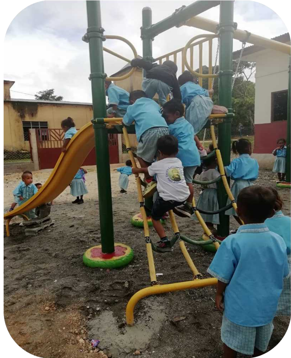
Playgrounds being erected by nuns at the Nino Konis Santana school in Ermera, Timor Leste