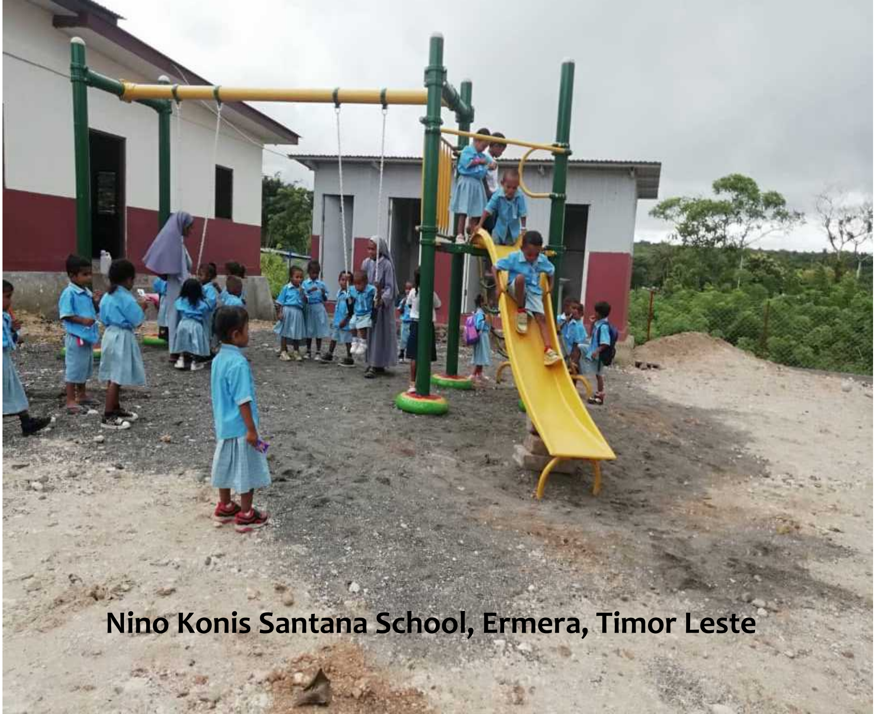
Nino Konis Santana School, Ermera, Timor Leste