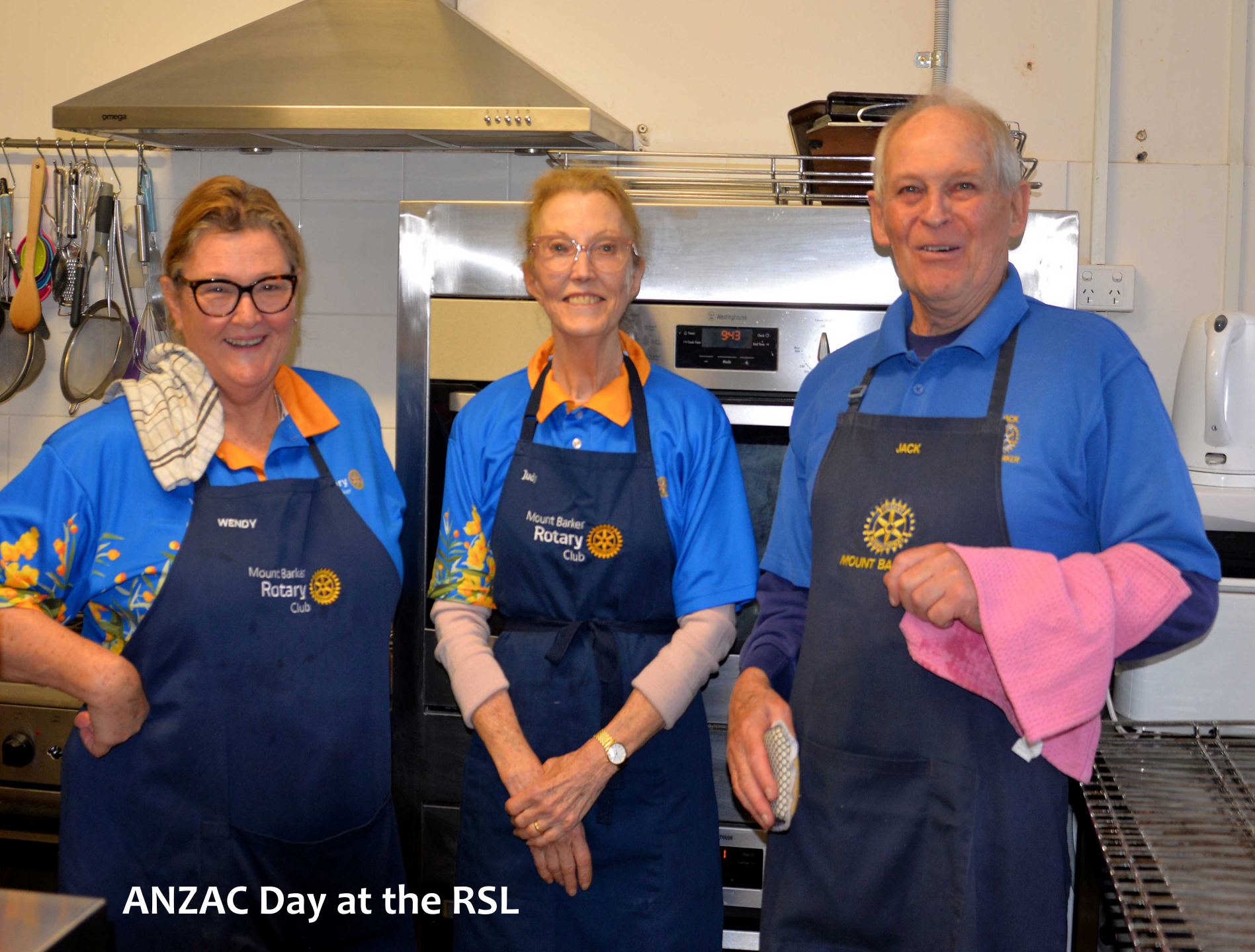
ANZAC Day at the RSL