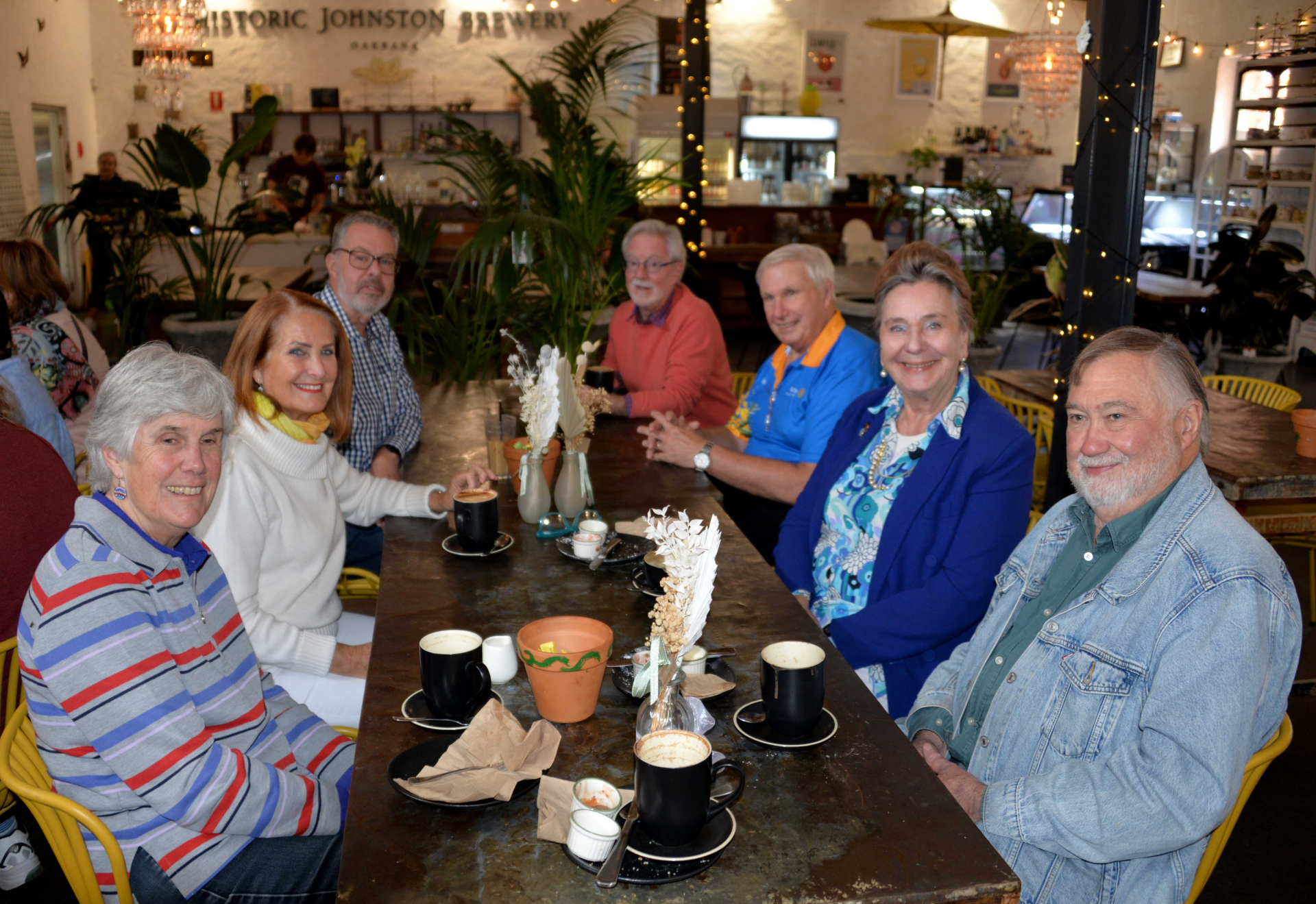
Café Meeting at Karkoo Nursery