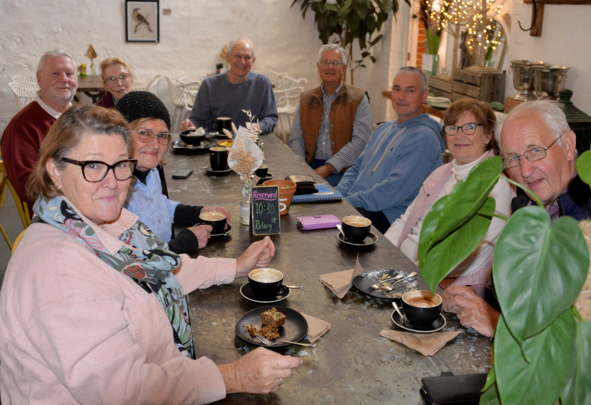
Café Meeting at Karkoo Nursery