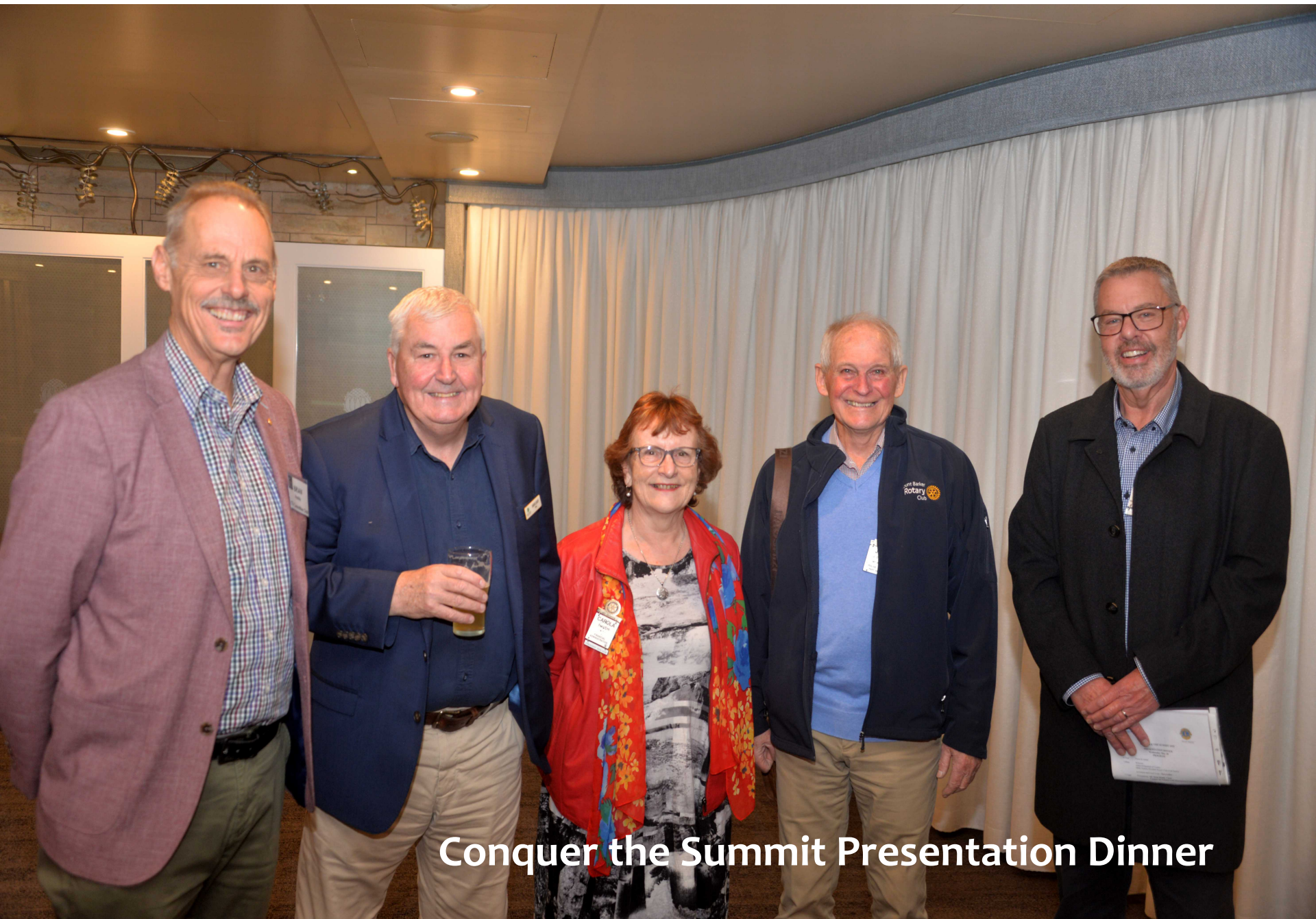
Conquer the Summit Presentation Dinner