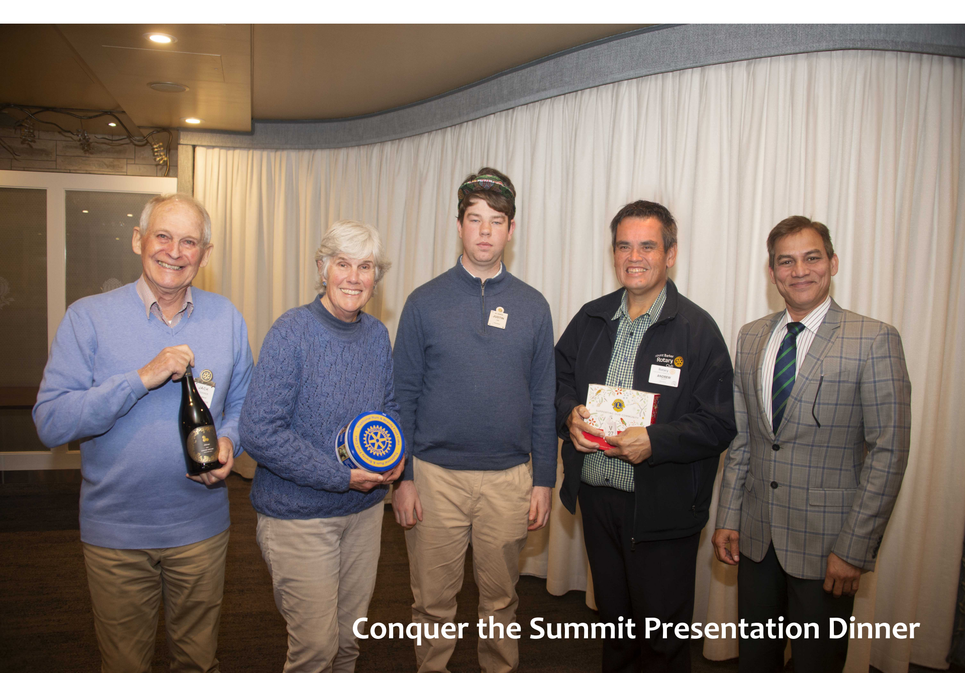
Conquer the Summit Presentation Dinner