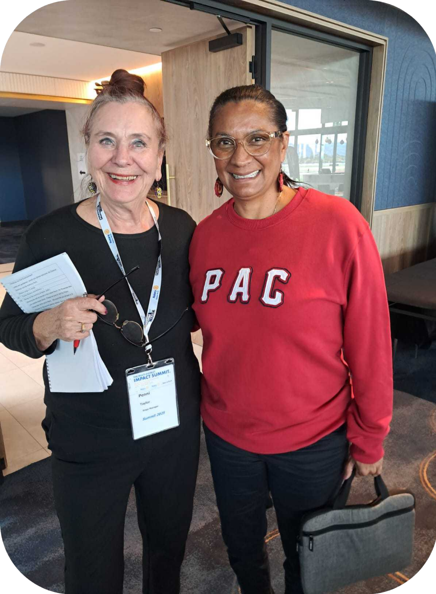
Multi District Impact Summit