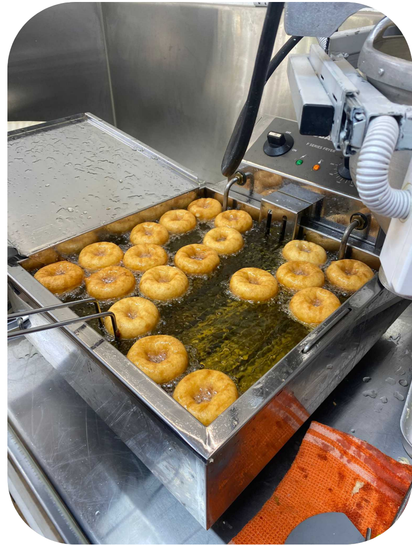
Birdwood Farm Day