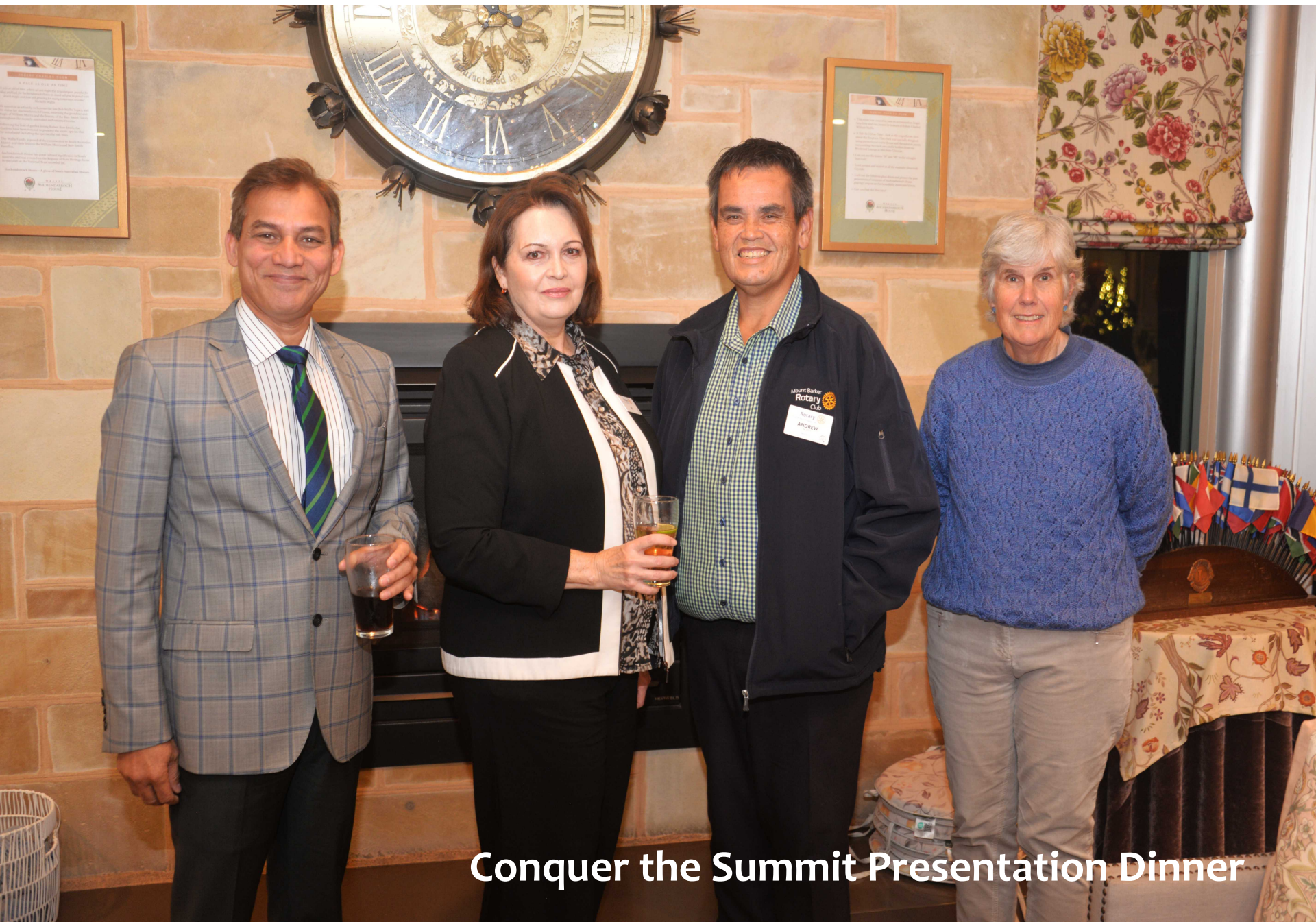
Conquer the Summit Presentation Dinner