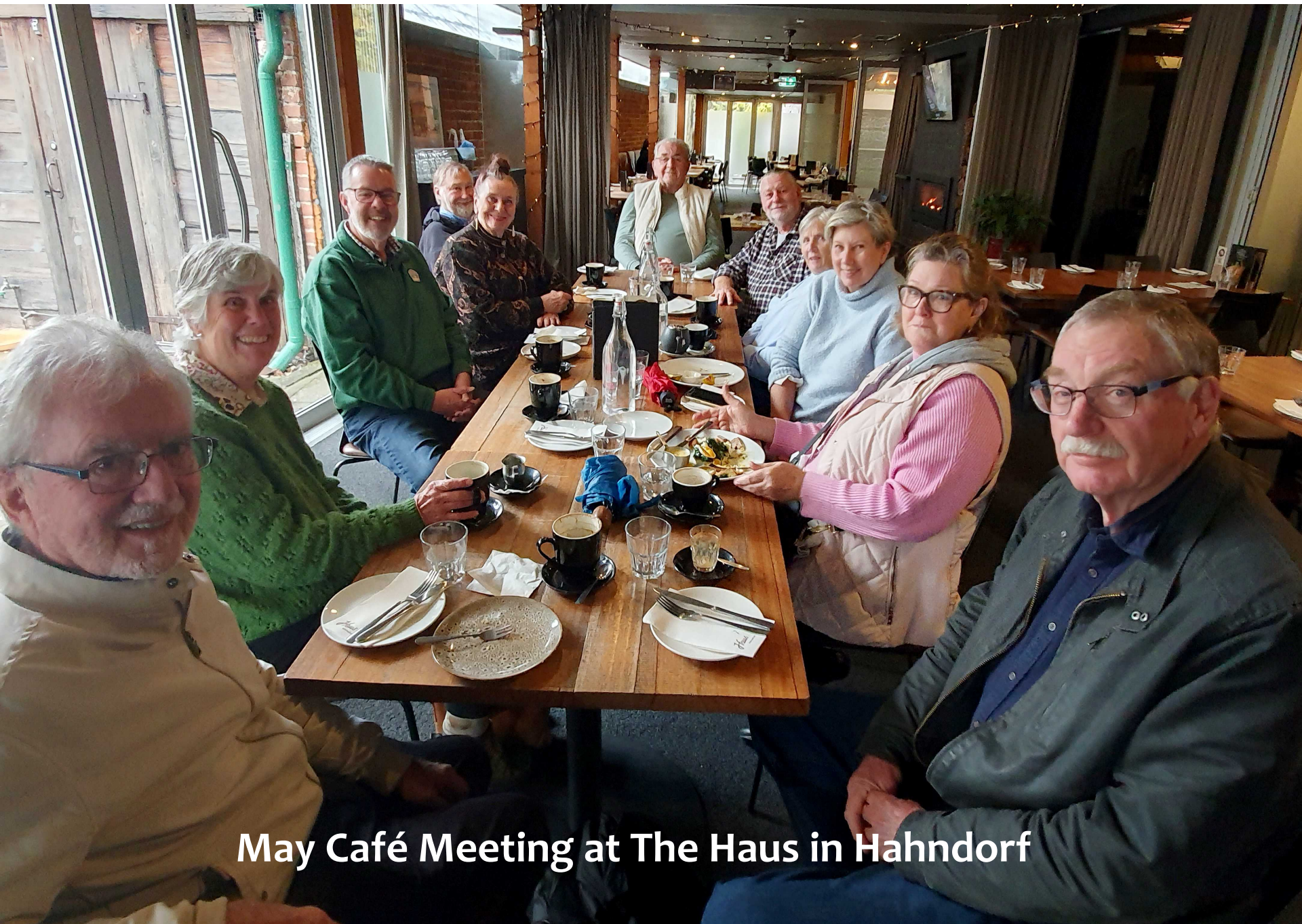
May Café Meeting at The Haus in Hahndorf