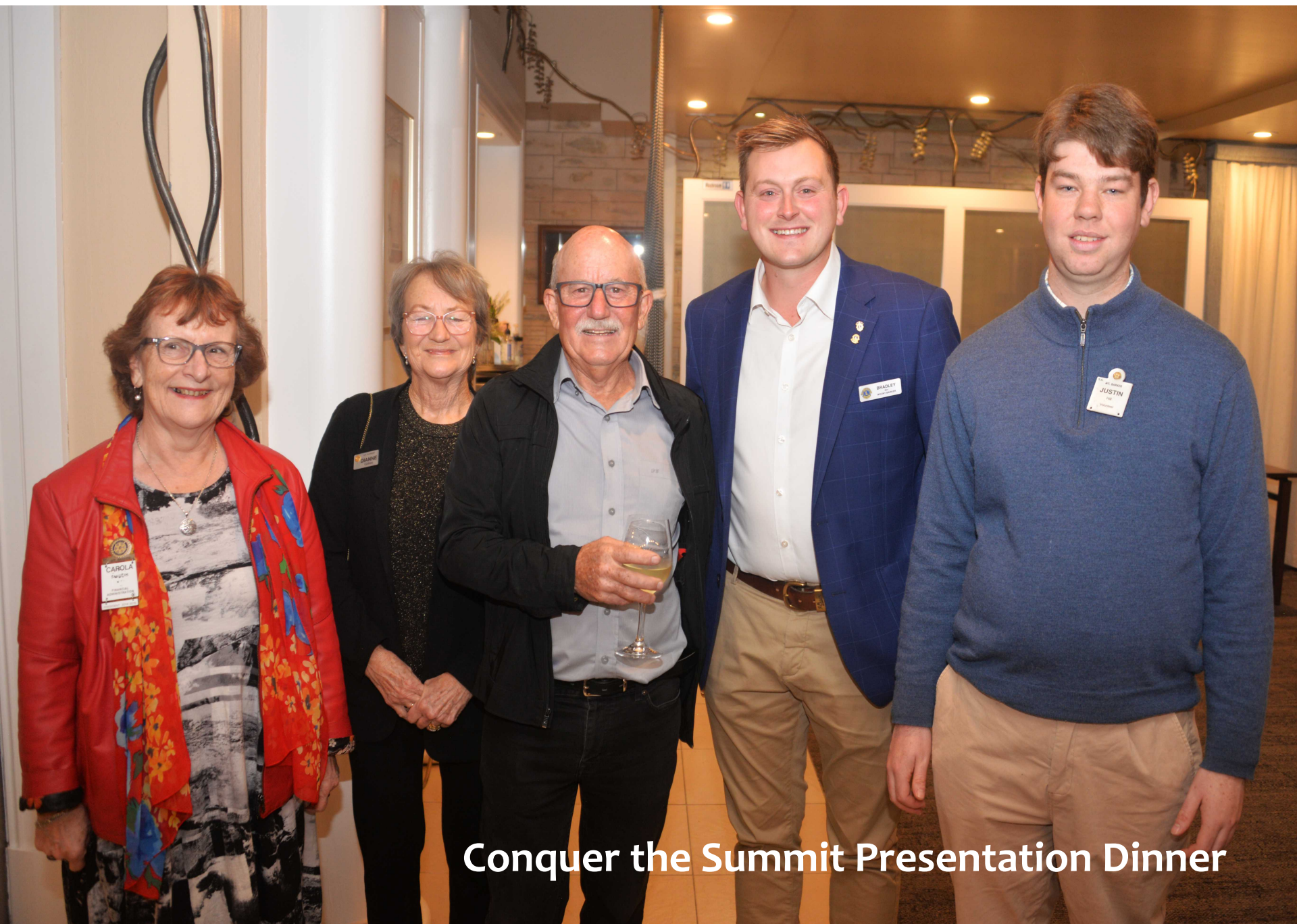
Conquer the Summit Presentation Dinner