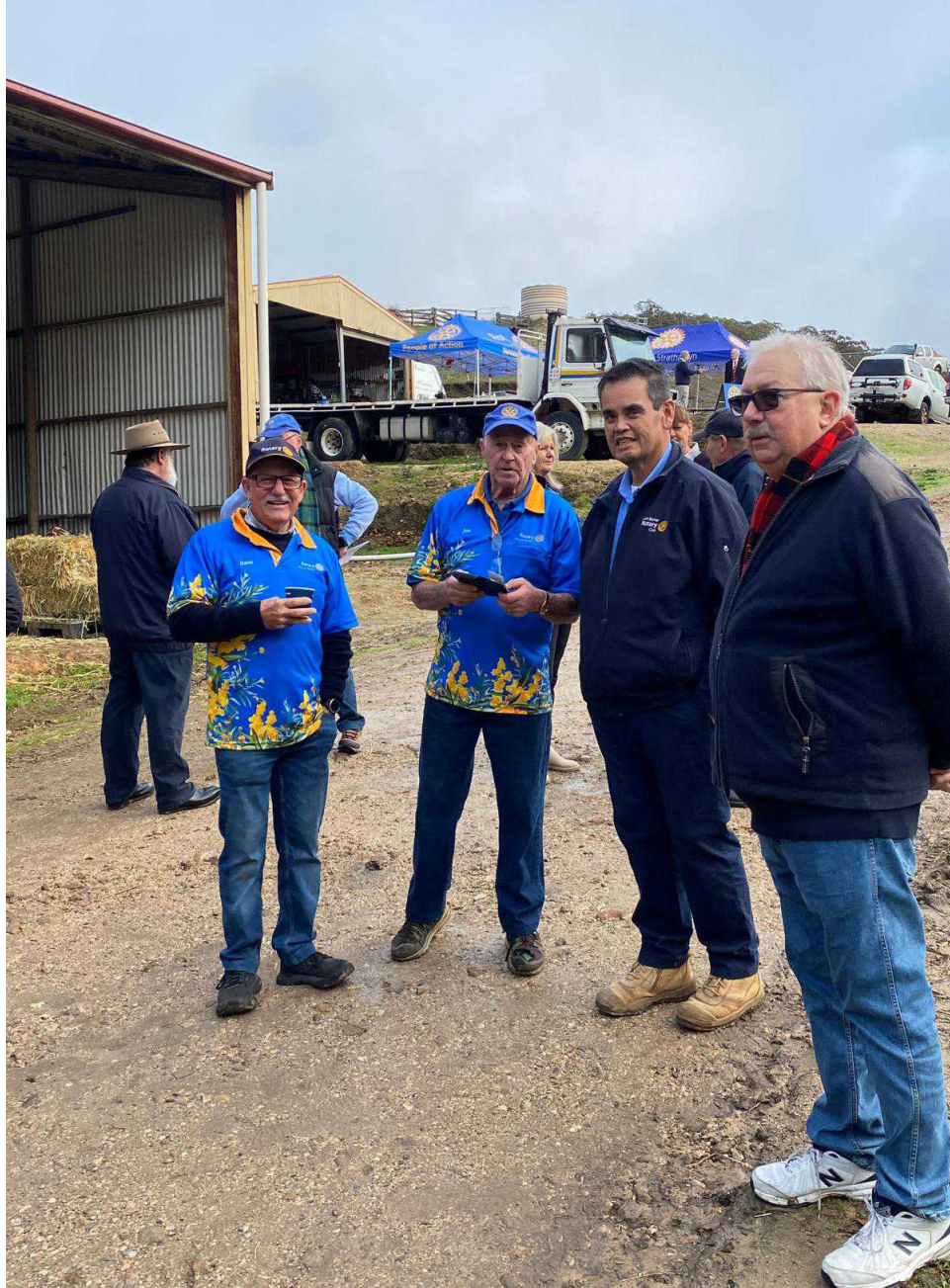
McHarg Family Farm at Ashbourne