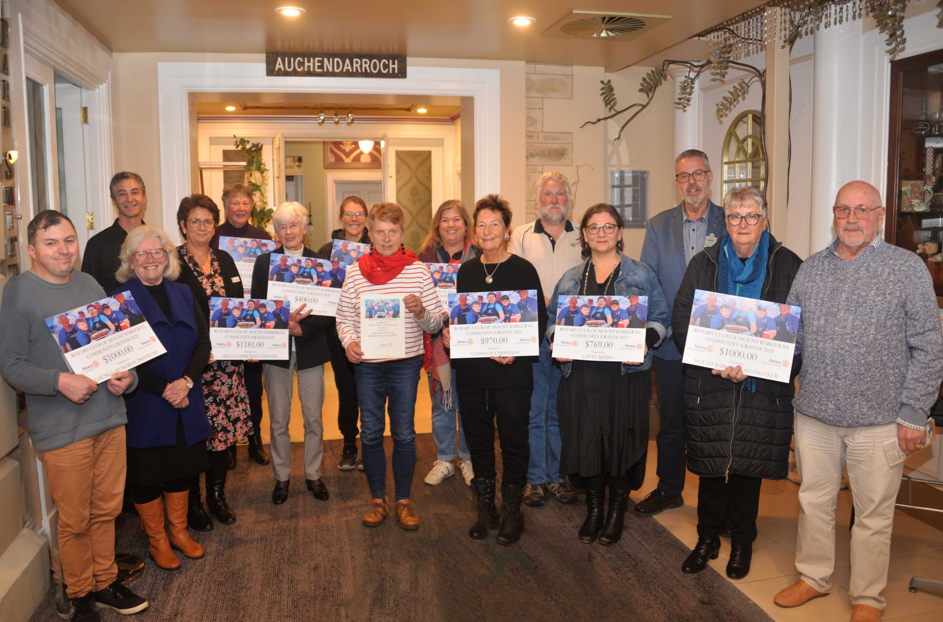
2025 Community Grants Recipients. June 16 th 2025