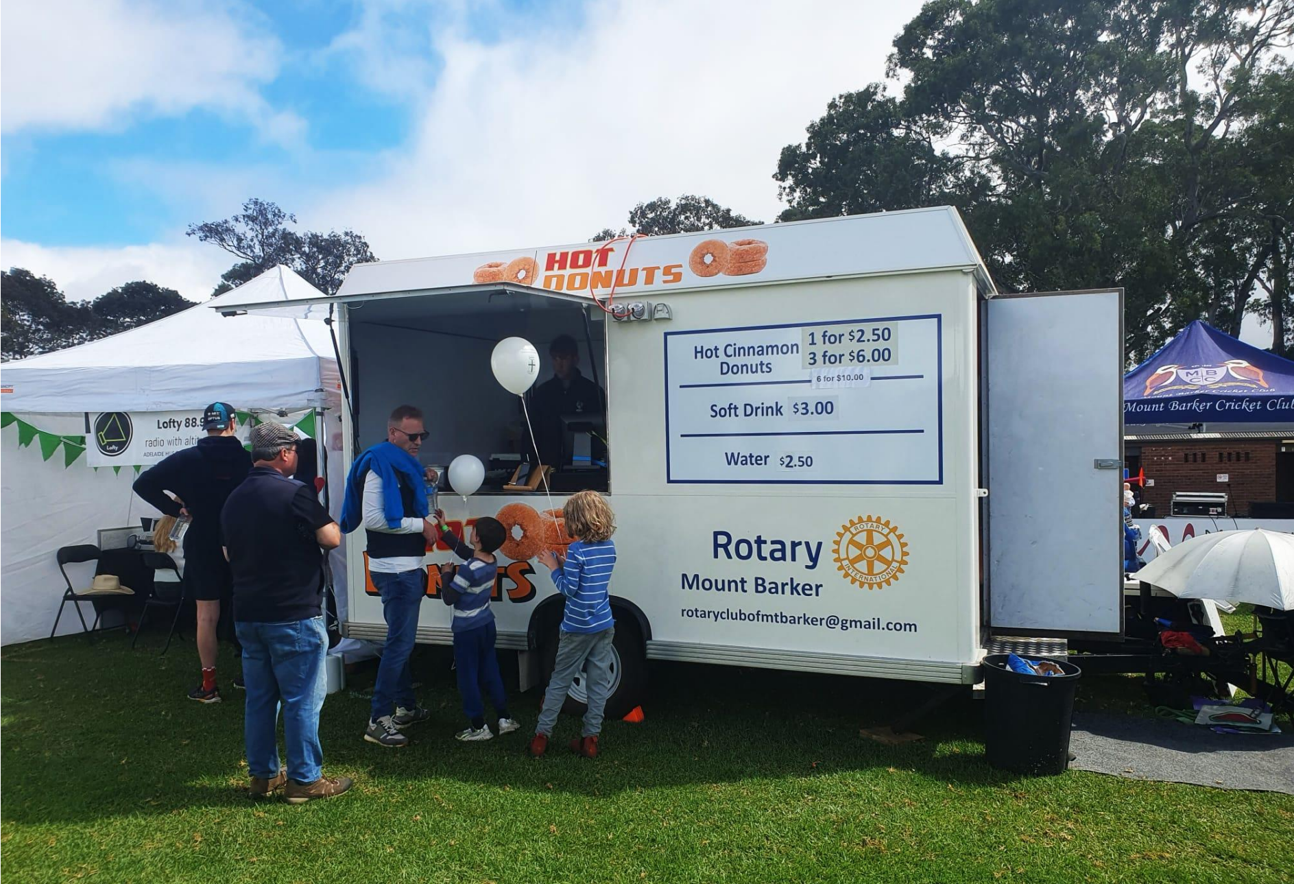
Our foot in the door at the Mount Barker Show