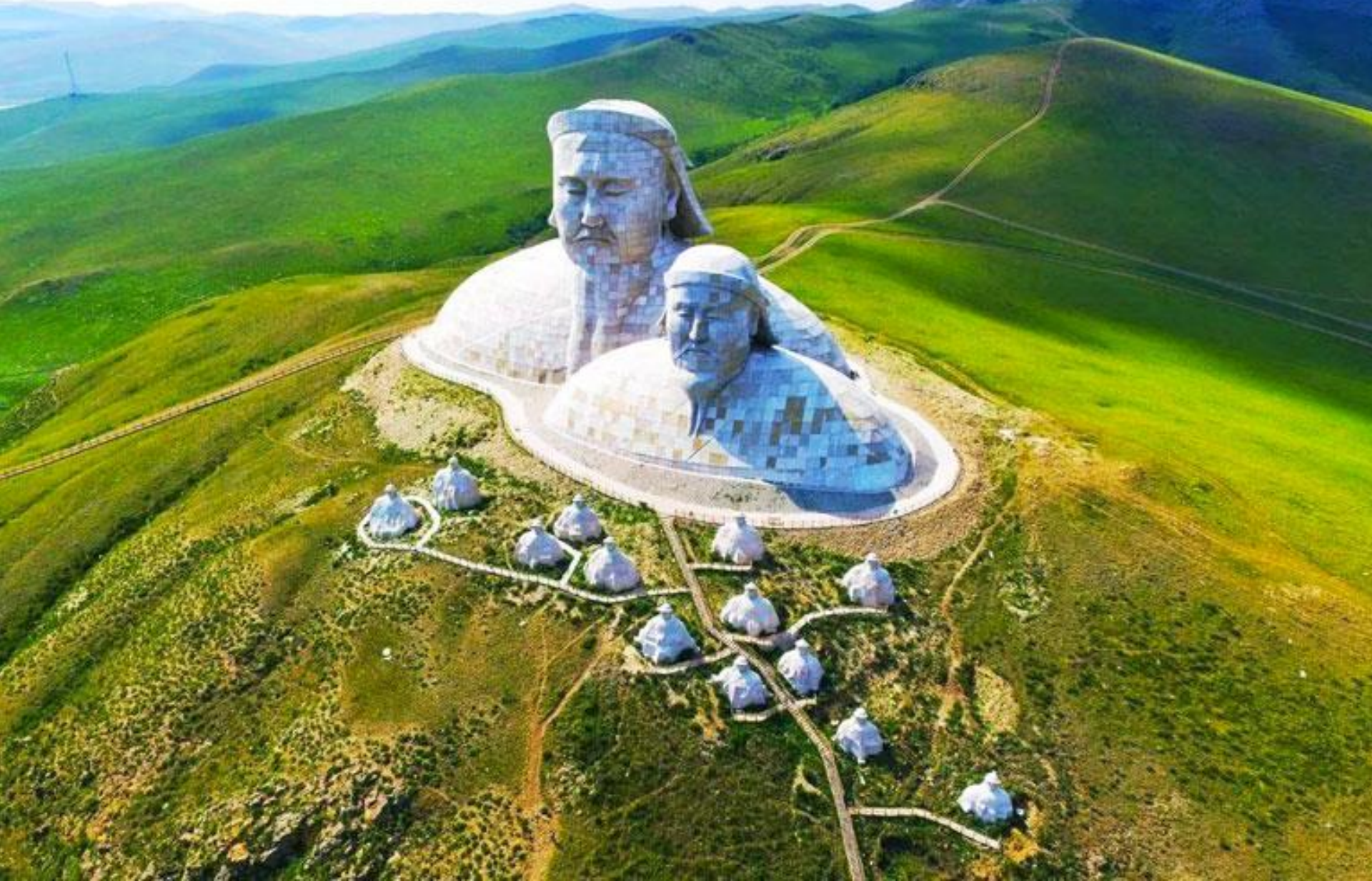
An impressive Mongolian Statue with yurts in foreground