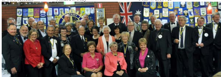
Paul Harris Fellows