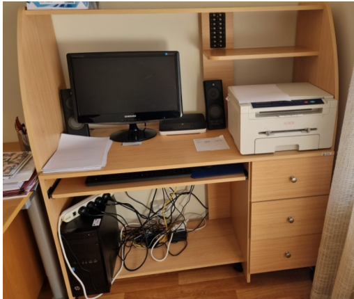
Computer Desk only (things on the desk not included)