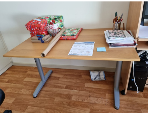
Office desk only (things on the desk not included)