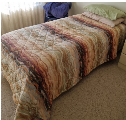
2 single beds - includes mattress, sheets, doona, pillows & cases, electric blankets