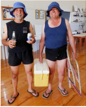
There really isn't any words for these 2 !!