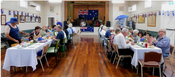
Everyone enjoying their meal