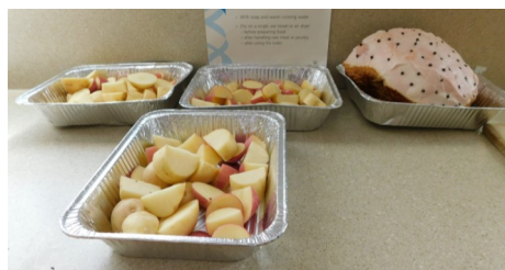
Potatoes & Glazed Ham ready for the oven