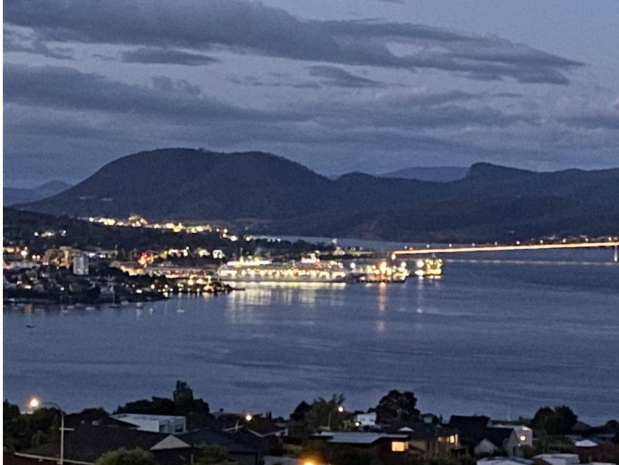
From their accommodation in Hobart