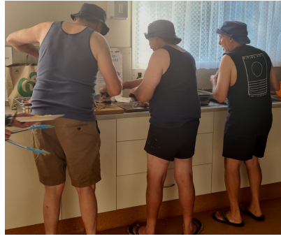
They found another one of their own breed