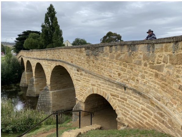
Oldest surviving Bridge in Australia at Richmond