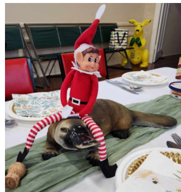
When Christmas meets Australia Day