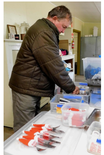
Claude in charge of the knives & forks