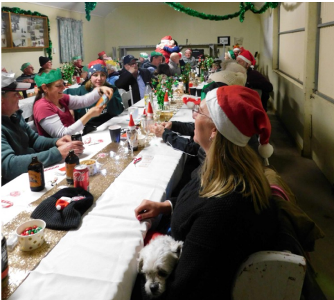
A great evening was had by all