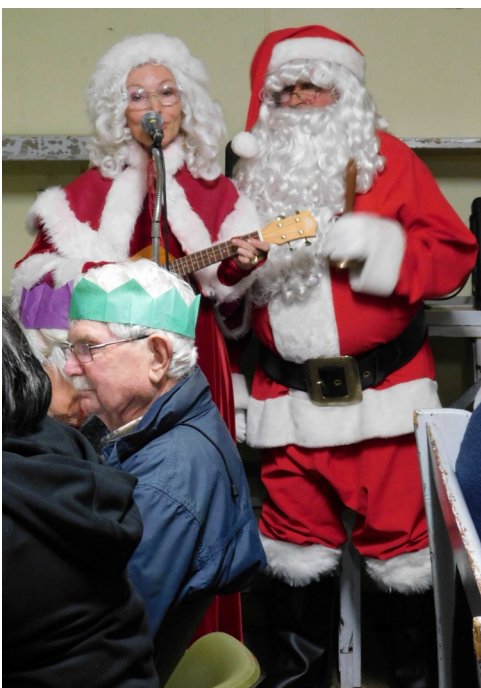
Santa with Mother Christmas