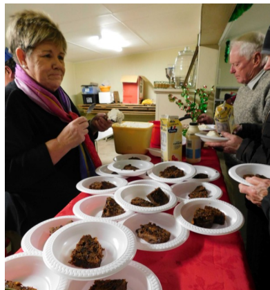
Shirley's Christmas pudding