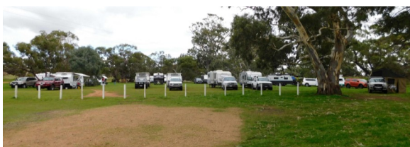
What a great turnout