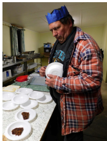
But there's no money in it :-)