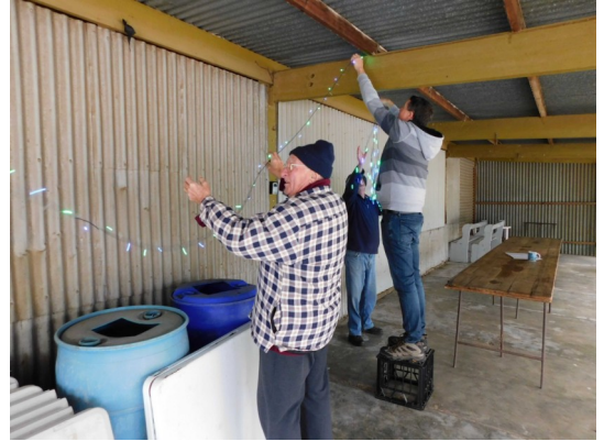
Men at Work