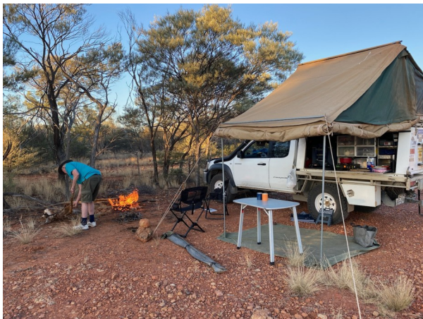
Jack & Jill's overnight camp near Stonehenge in Qld