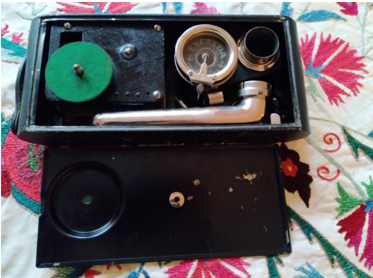
Pocket Gramophone - Sold at du Plessis auction for $200.

Also two other items submitted to auction have realised excellent outcomes.