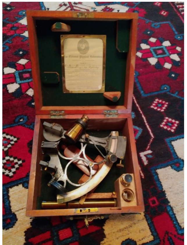
Sextant Sold at du Plessis auction for $775.00