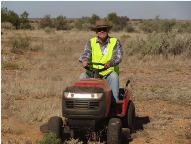
Mowing the stones for the Annual cricket match –

•Bakery serving to public from 2012 - Bakery Open for eight weeks each year during Volunteer Work Schedule 21 May – 17 July 2022 – For more information please check the Facebook Page – Farina South Australia