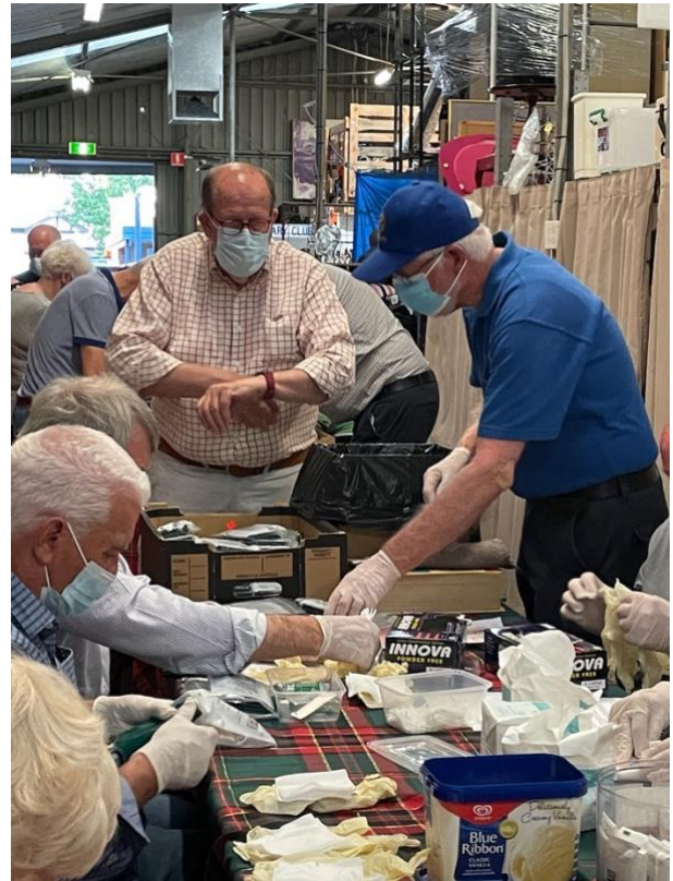
Pic showing The Club Assembling Birthing Kits - Oct 2021 This was an International Committee project. Ed.

The early learning centre at Prek Trabaek is now up & running with 50 students attending. The centre is operating in temporary accommodation until the RAWCS funded building is constructed. Older students have commenced computer classes with children as young as 5 joining the kindergarten classes. Many items have already been purchased for the new centre (desks, chairs, generator etc). To date donations of $23,717.64 have been received by RAWCS from various Rotary Clubs & Rotarians for this project. Building is expected to commence in the second half of this year.