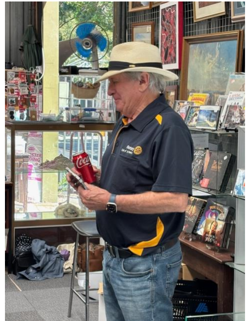
All hands on deck and a very successful project within the community and fundraiser for the Club.