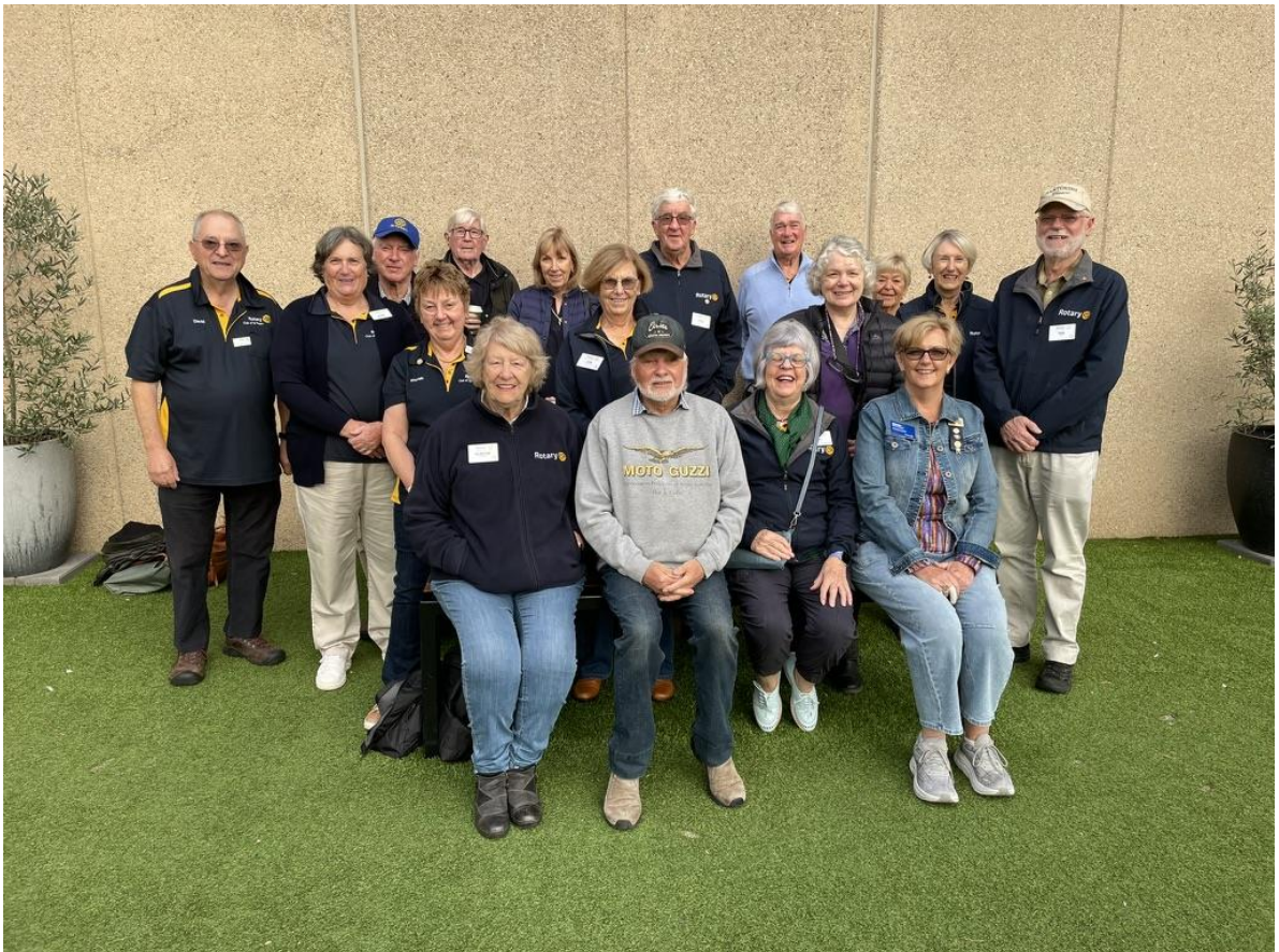
← The Gala Dinner

Next Year Warrnambool 17-19 April – 2027 – See you there I hope!