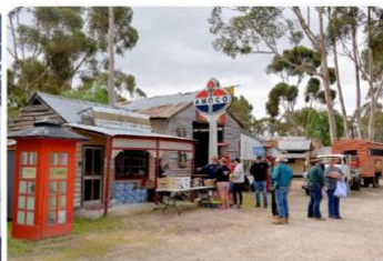
Attractions and Activities