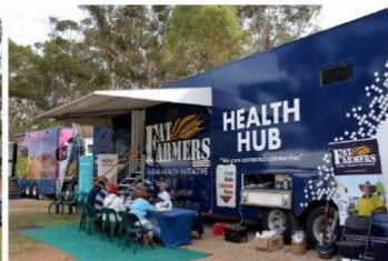
Farmer Health Hub