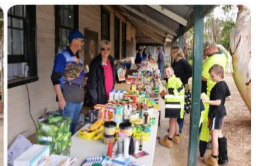
$50,000 + Grocery Giveaways

Flick through over 100 Photos to paint the picture for yourself:- https://rotarypioneeradventureday.au/photo-gallery