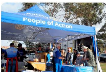
All Day Food & Entertainment

The passion of so many Rotary Members never ceases to amaze me, and without all of you, we could not have made Rotary's Pioneer Adventure Day happen so incredibly successfully.