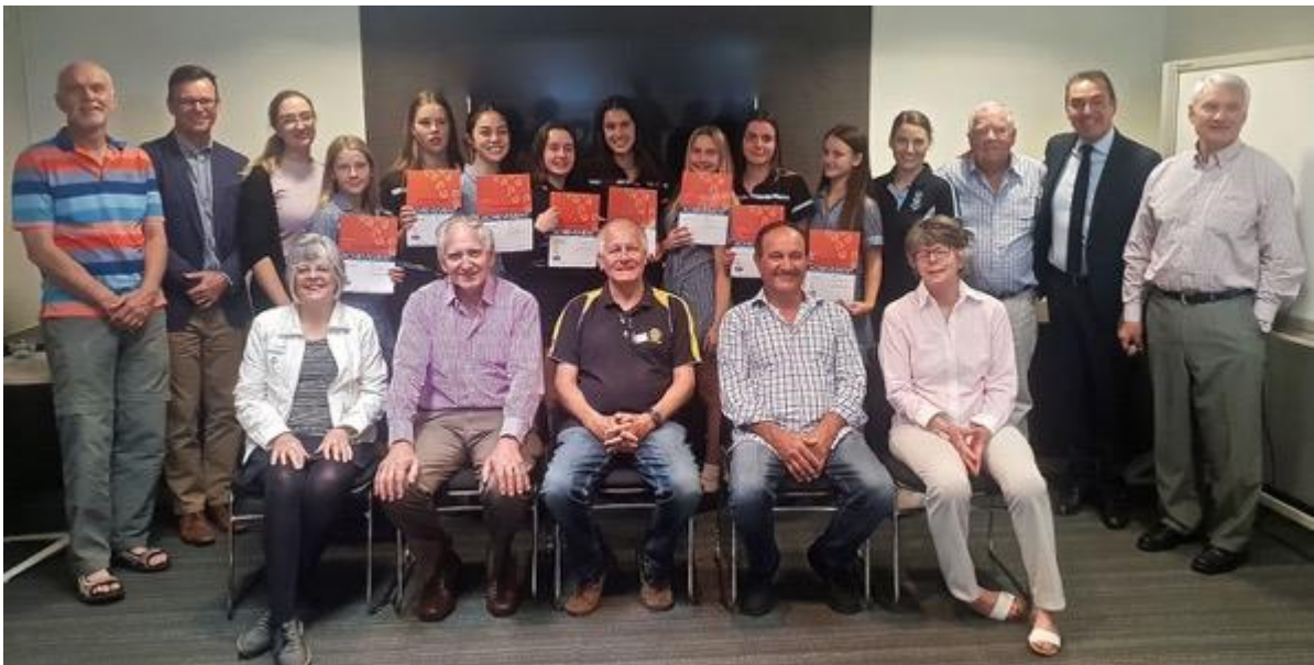
Operation Flinders Marryatville High School Exercise