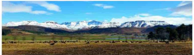
Mountains in Lesotho under snow.