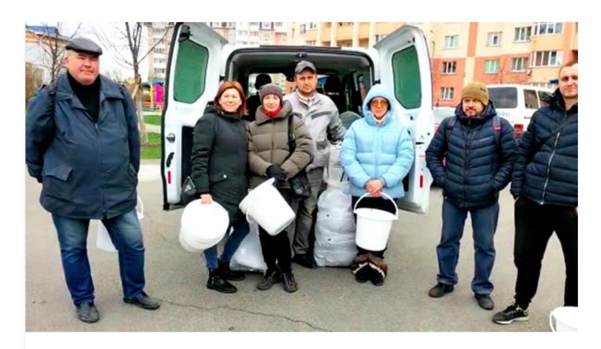
ShelterBox and ReliefAid working with community representatives to distribute aid to communities in Kyiv

In recent times the committee has received requests from both ShelterBox & the Rotary Foundation requesting support for their programs established in response to the humanitarian crisis in Ukraine. It was resolved by the committee to make a donation of $1000 to the Rotary Foundation Disaster Response Fund as we have assisted ShelterBox earlier this year.