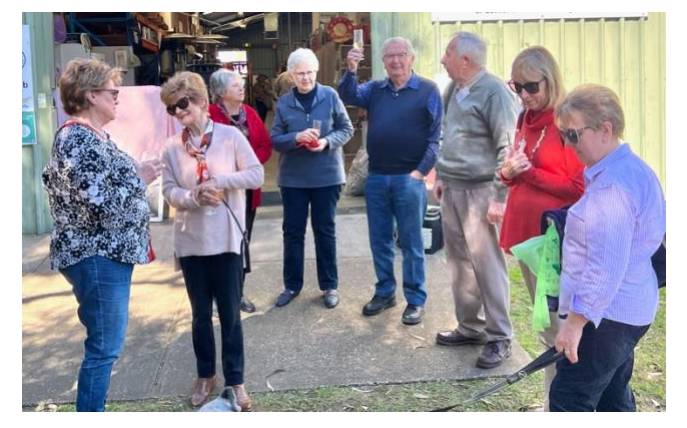
On arrival everyone enjoyed pre-dinner cheese & dips along with a glass of sparkling wine, beer or a soft drink. It was great to get together & enjoy fellowship with our fellow Rotarians, partners & the volunteers.