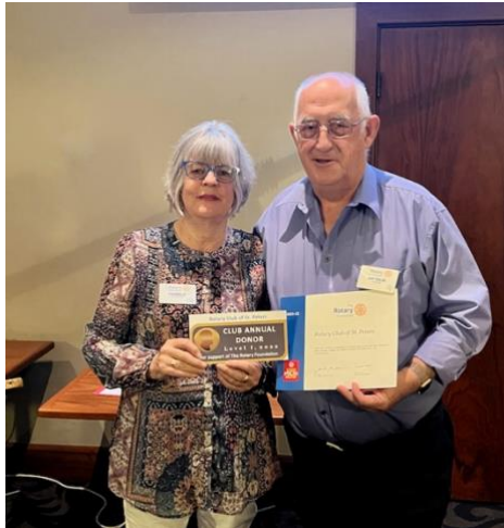
Rotary Club of St. Peters