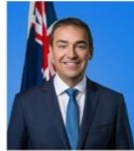
HON STEVEN MARSHALL MP MEMBER FOR DUNSTAN

I INVITE YOU TO JOIN WITH ME THIS CHRISTMAS SEASON TO DONATE TO THOSE IN NEED IN OUR COMMUNITY