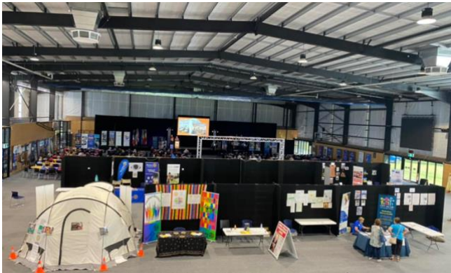
House of Friendship (9510 Facebook pic)