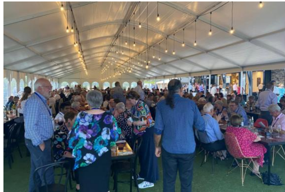
Gala Dinner (9510 Facebook pic)