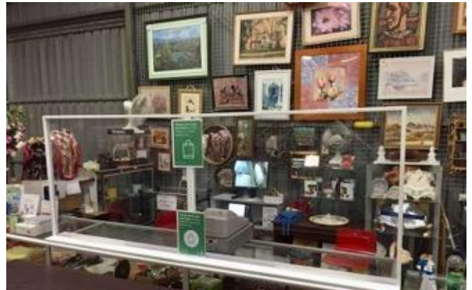
The new look counter