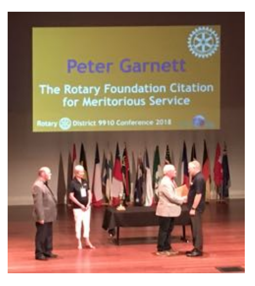
Our conference team.

As I said at Monday's meeting I stand in awe of the passion and enthusiasm of many people who run various projects. This leads on to the fact that there are so many good projects out there which are under the auspices of Rotary that it makes it difficult to know exactly which one to fully support. Again this leads on to the fact that many of these projects would not happen were it not for Rotary Foundation. That being the case my plea to you is to support Rotary Foundation. There are a number of ways in which you can do this. Obviously joining the Centurions Club is one. They also have small collection boxes very similar to the old Barnados box which many of you would remember from your youth and into this can go your loose change and make a contribution to Foundation. Remember that this year we were awarded the cup for the most Rotary Foundation contributions of the District and it would be nice to repeat that again next year.