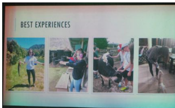
Best experiences – SI trip, Dargaville-feeding a lamb, Challenge Camp – challenging but very rewarding.