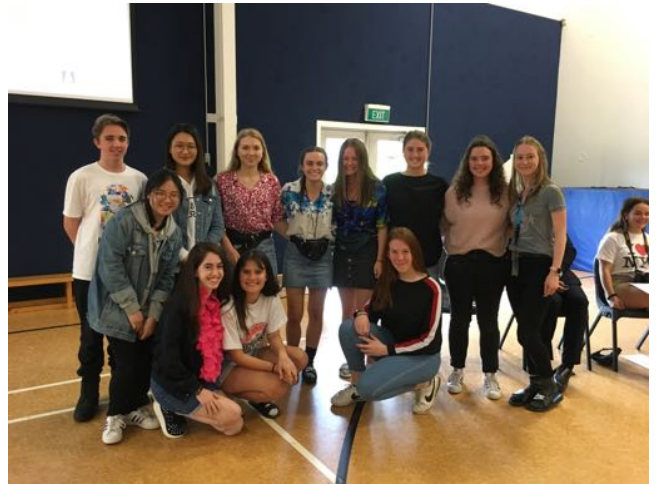
Photo is of the Pinehurst interactors after receiving their badges at the final assembly.

Browns Bay Quiz night Fundraiser to raise $5000 for a needy family. Help the three Dixon children who have recently lost both their parents.