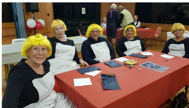
It was a great night and we had lots of fun.

Two people have been designated to visit each club. One aim is to stop parochialism.