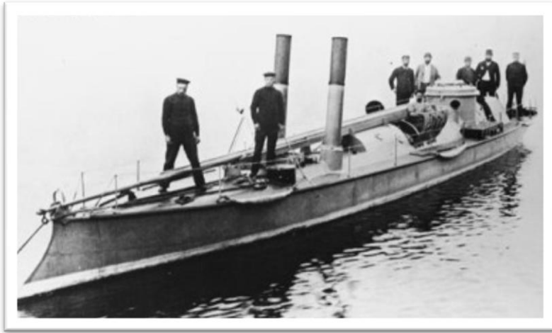
Torpedo Boat at Torpedo Bay Devon port