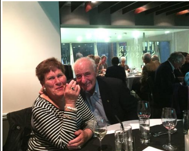
Dinner at AUT