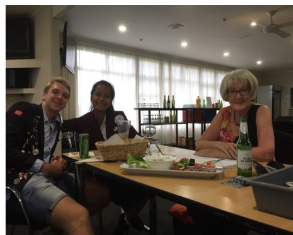
Our 2 helpers and Judge.

Conference. Whangarei. It's still not too late. Robyn has some rooms on hold at the hotel.