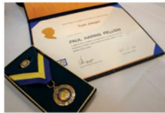
Paul Harris Fellow Certificate

Undoubtedly the most important step to promote voluntary giving to The Rotary Foundation occurred in 1957, when the idea of Paul Harris Fellow recognition was first proposed. Although the concept of making US$1,000 gifts to the Foundation was slow in developing, by the early 1970s it began to gain popularity. The distinctive Paul Harris Fellow lapel pin and attractive certificate have become highly respected symbols of a substantial financial commitment to The Rotary Foundation by Rotarians and friends around the world.