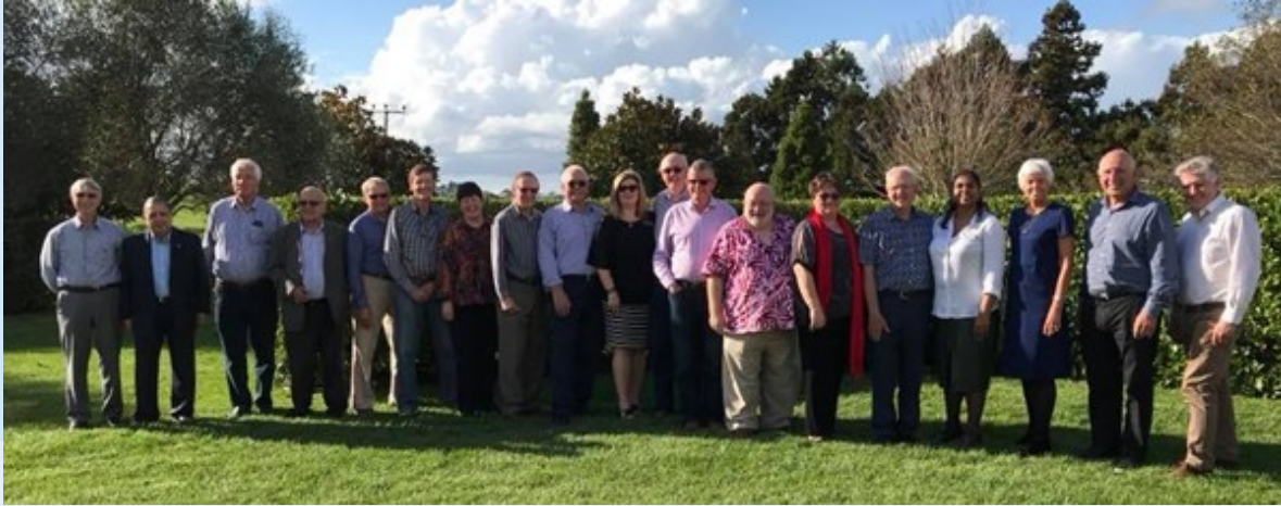
The team of Past and Future District Governors!