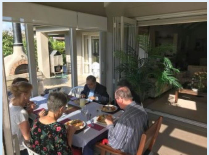
Tucking into a scrumptious lunch!