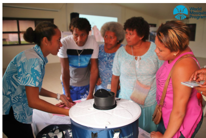
Learning about how to grow the mosquitos carrying the Wolbachia bacteria

Supported and funded by the Australian Government's innovationXchange and with overwhelming community support, the World Mosquito Program commenced releases of mosquitoes with Wolbachia in Tamavua Village in July 2018.