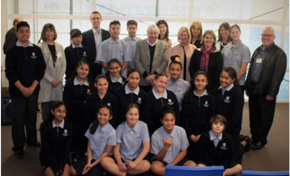
2018 mid-year graduates with REP sponsors

Should you wish to assist the the Reading Enrichment Programme -