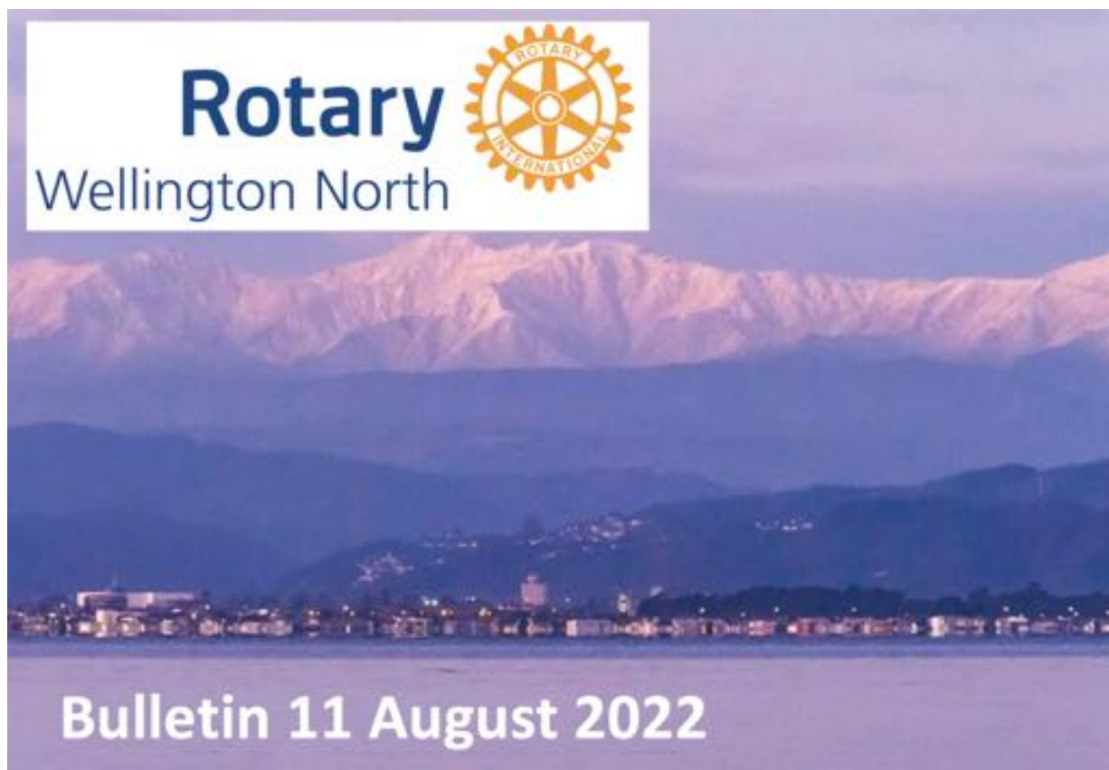
From Petone Beach to the Tararua Range