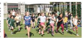
Another Ngaio School cross country race gets under way as senior girls take off at full pace.