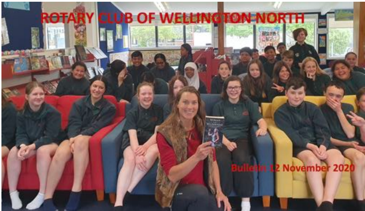
Adventurer and writer, Miriam Lakewood at Wainuiomata Intermediate School