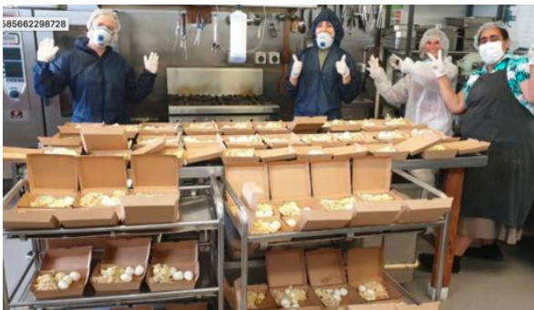
Rescued food bagged up at the Soup Kitchen