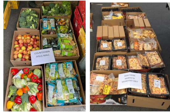
KCA Rescued food from Countdown Johnsonville Mall [left] and Churton Park New World